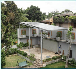
Residential Stand-alone Structure Mounted System, Maharagama