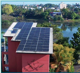
Residential Roof, Rajagiriya