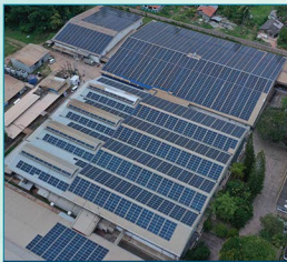
Eskimo Fashion Knitwear (Pvt) Ltd, Negombo