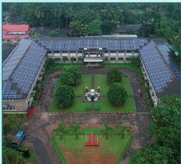
Sri Lanka Army Base Hospital, Panagoda