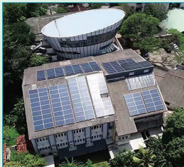
Institute of Engineers Sri Lanka, Colombo 07