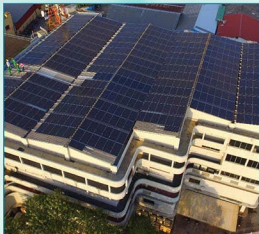
Solar Roof Top Systems at Akbar Brothers, Colombo 10