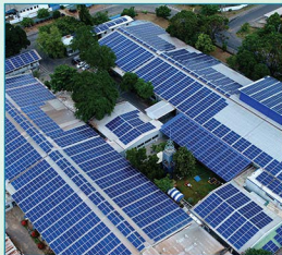
Isabella (Pvt) Ltd, Katunayake