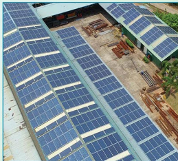
LTL Galvanizers (Pvt) Ltd, Sapugaskanda