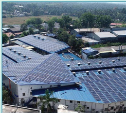
Hi Fashion Holdings (Pvt) Ltd, Homagama