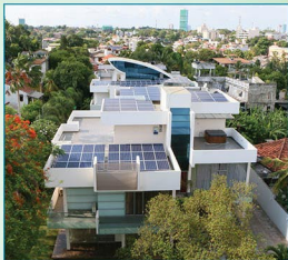
Residential Slab, Kirulapona