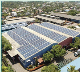
LTL Transformers (Pvt) Ltd, Angulana