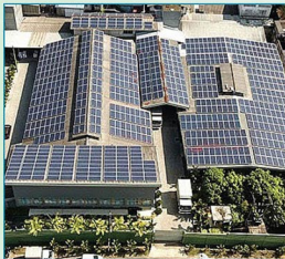
Screenline Holdings (Pvt) Ltd, Katunayake