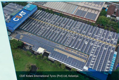
CEAT Kelani International Tyres (Pvt) Ltd, Kelaniya

"Regen Solar" have successfully Engineered, Procured and Constructed Solar PV projects in a wide spectrum of clients premises. They include Utilities, Government, International Donor Agencies, Apparel, Energy, Tea, Coconut, R&D, Galvanizing, Transformer Manufacturing and Service sector to name a few.